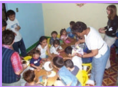
MOST Ministries Michigan Women in Mission $20,000

These funds pay for interpreters who accompany MOST mission teams enabling the teams to communicate and share the Gospel message with the people they are serving.