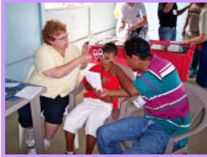
MOST Ministries Interpreters for the Mission Field $15,000

These funds pay for interpreters who accompany MOST mission teams enabling the teams to communicate and share the Gospel message with the people they are serving.