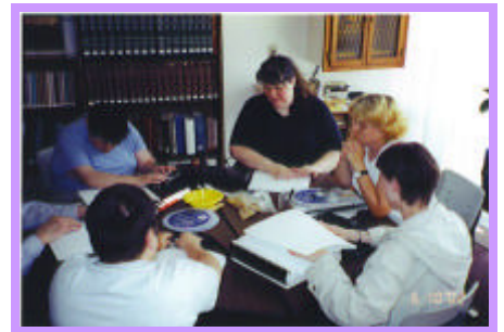
Outreach Centers for the Blind Flint & Ann Arbor, MI $10,000

LWML has provided opportunities for women of the Michigan district to experience the joy of serving the Lord through mission trips. This grant helps off-set the cost for women to be a part of the mission teams.